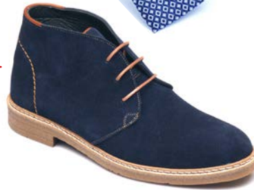
Shoes — juxtapose your gunmetal frame with a splash of color