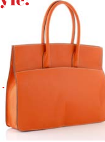
Elegant bag — takes you through the day with all the essentials at your fingertips