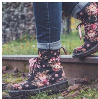
Patterned boots — a ripple of color for a more vivid touch