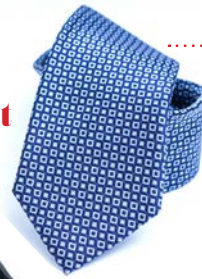
Classic necktie — for something a bit more formal