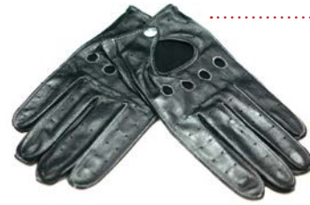
Black leather gloves — the all-purpose "cool" accessory

Sometimes it's hip to be square, and square is everywhere. Unisex and uni-style, rectangular frames are always a great fit that go with just about anything. Pick a look, any look: any color, any material, any pattern, you can make it work for a statement that says "I'm In."