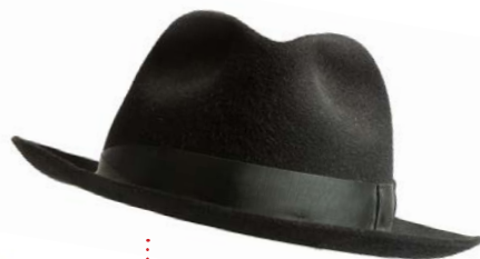
Black hat — whichever way your frames fade, this tops things right off