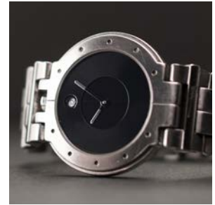
Silver-toned watch — tell time the classic way