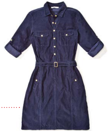
Denim dress — it's not just for casual Fridays